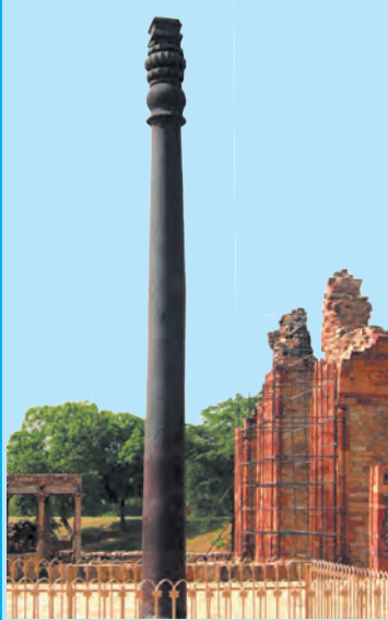
Iron Pillar : Mehrauli

You would like to know : In the Gupta period, there was remarkable progress in making alloys and casting of metals. The